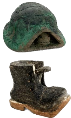
One of our newest and youngest members, Coop, shared two carvings with us – a tortoise and a boot.