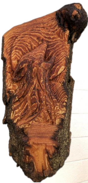
relief carving of wolf and moon