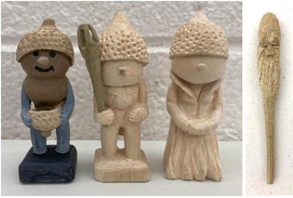
Acorn people and a spare club for the guy in the middle.