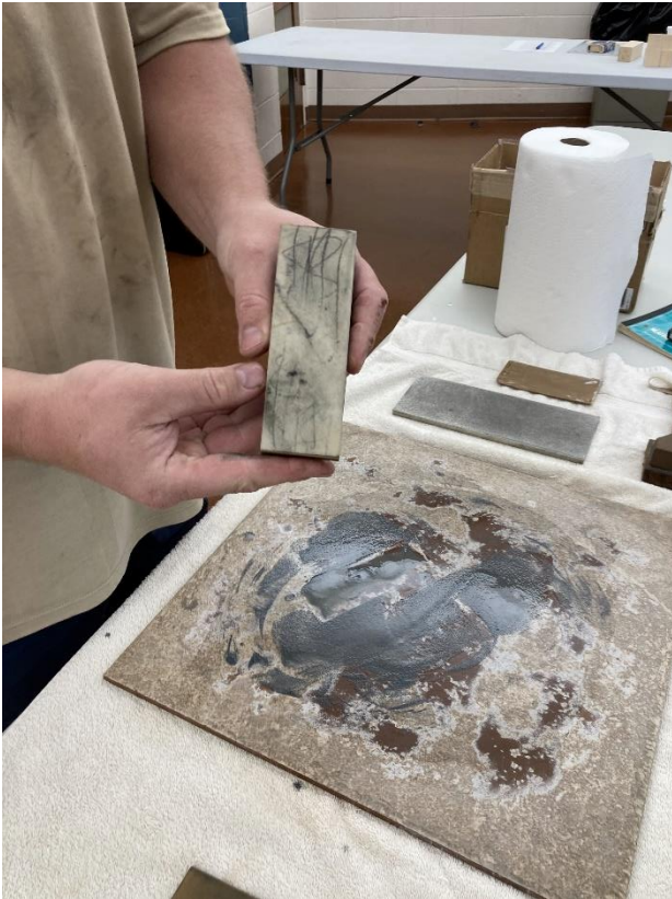
He rinsed the stone periodically so that he could see if there were still grid marks indicating low spots.