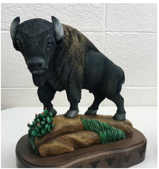
Fred Self shared a finely carved and painted bison, as well as a bark carving of a mountain man.