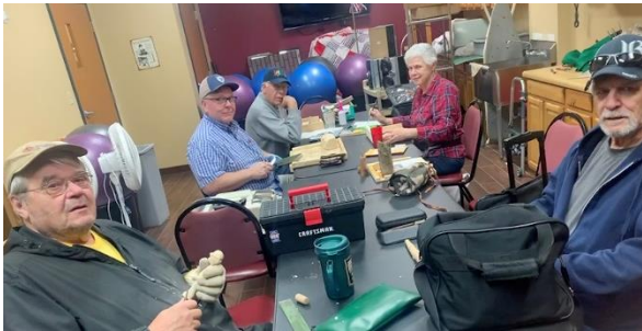
The Yukon Carve-in earlier this month.