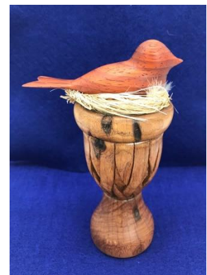
Jay Allen shared a carved bird in a nest. He used a wood lathe to turn the pedestal and then carved it to look like wicker. The pedestal is made from mesquite, and the bird is carved from padauk.