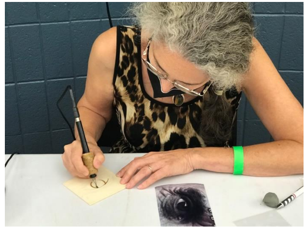
She talked a little about pyrography basics and considerations that go into depicting an eye.