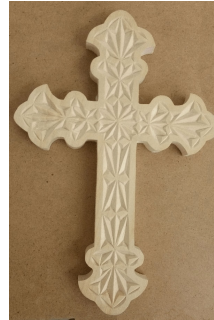
Ralph Green Chip Carving "Cross"