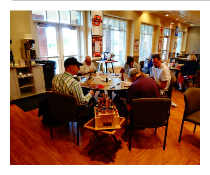
Edmond Senior Center on 10/1/15