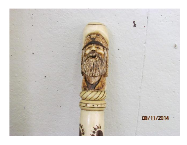
Fred Self's walking sticks