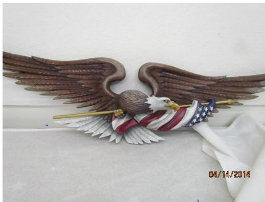
Eagle by Fred Self