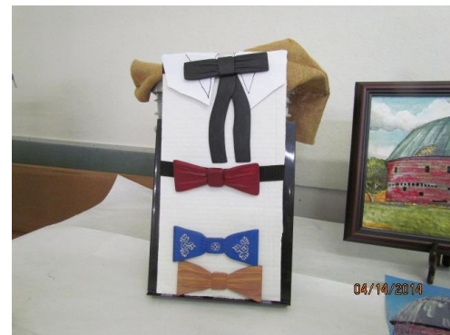
Bow Ties in Wood by D.J. Boyce