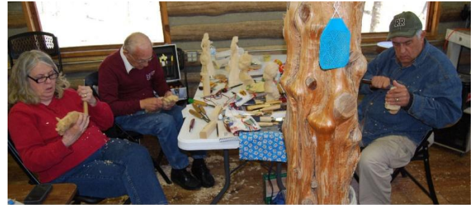
Everyone stayed busy and the floor filled with piles of wood chips.