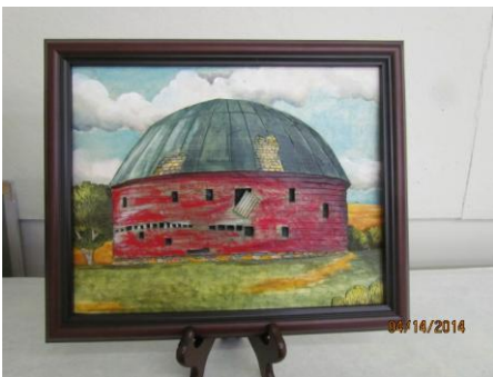
Arcadia Round Barn – Kent Wallace