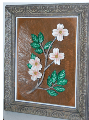
< Fred Self's version of a deep relief carving of a dogwood flower begun in Kevin Walkers class.