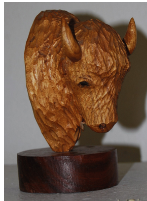
< Ralph Green