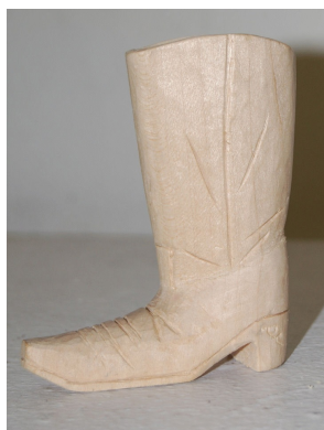
< Sam Escobedo's version of a cowboy boot.