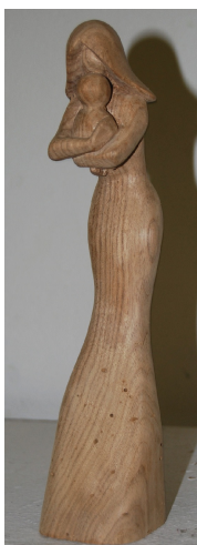
Pete Zachry's > version of a stylized mother and child in butternut. Unfinished.