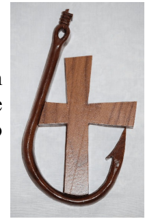
Ralph Green Hook and Cross

Ralph Green brought these two crosses to display.