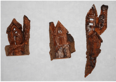
Harriot LaGrone Small Bark Carvings "Refrigerator Magnets"

Harriot LaGrone is still carving small Gnome Homes. These are equipped with magnets for the refrigerator door.