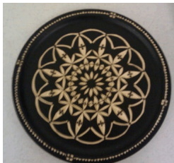
D.J. Boyce's "Chip Carved Plate"