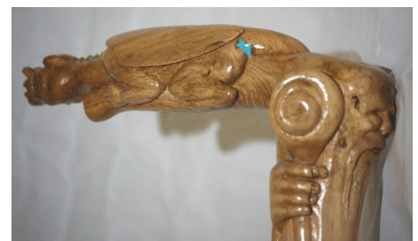
Walt LaGrone showed his first effort in cane carving (left) and a much later project (above). Both are from Yaupon Holly that Walt harvests from locations in East Texas.