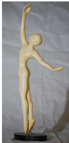
Pete Zachry brought two items - "Pixie" carved from Holly (right) and a caricature lady in blue (lower right) from a Phil Bishop roughout.