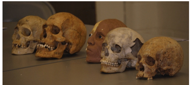
These are only some of the artifacts and teaching aids that Traci presented during our discussions of anatomy .

real life adventures added color to an already enthralling presentation.