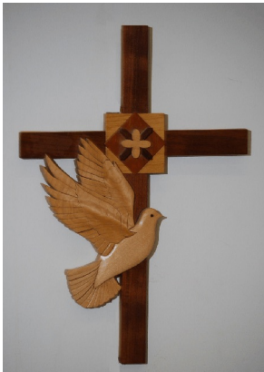
Combined intarsia and woodcarving skills were shown here on Ralph Green's "Cross and Dove".